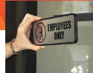
Secure plastic signs to window glass.

Additional 3M™ Dual Lock™ Reclosable Fasteners available. For more information visit www.3M.co.uk/fasteners or call 0870 60 800 60