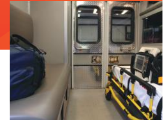
Attach cushioning panels in an ambulance or bus.