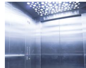
Attach lift control panel to interior wall.