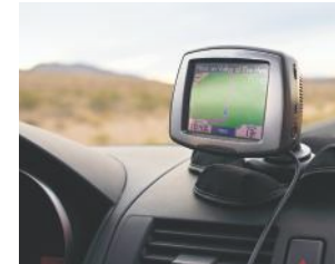
Anchor vehicle accessories to dashboard.