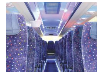
Fasten ceiling panels to interior for future access.